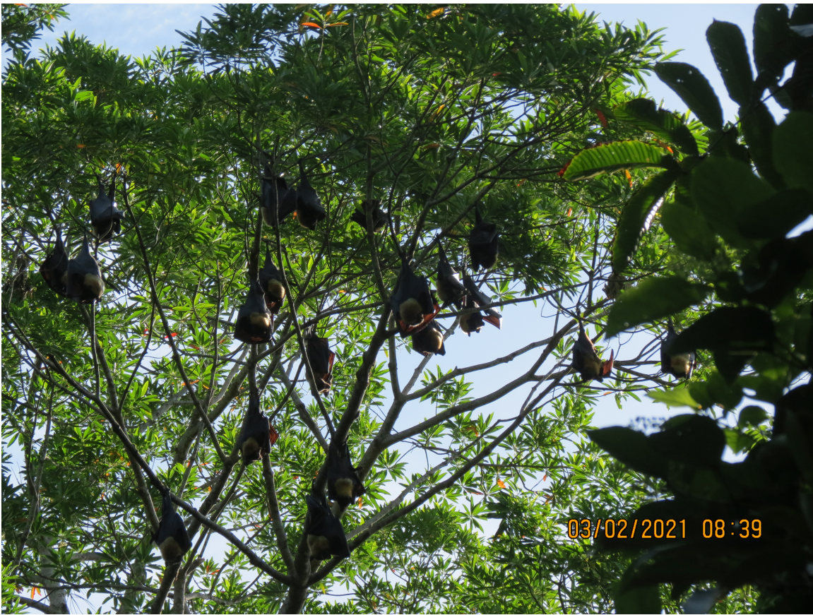
Flying foxes in the morning!

off to release). In 2019 there were hardly any bats. This year (2020) there have been several thousand bats, who change locations daily (although things are calming down now (Jan 2021). This has been an issue over the whole area. Anyway, the Station (Cluster Fig Nature Refuge), seems to have become a favourite place for the bats - and we get woken up in the morning by the bats carrying-on in the trees above the cabins.