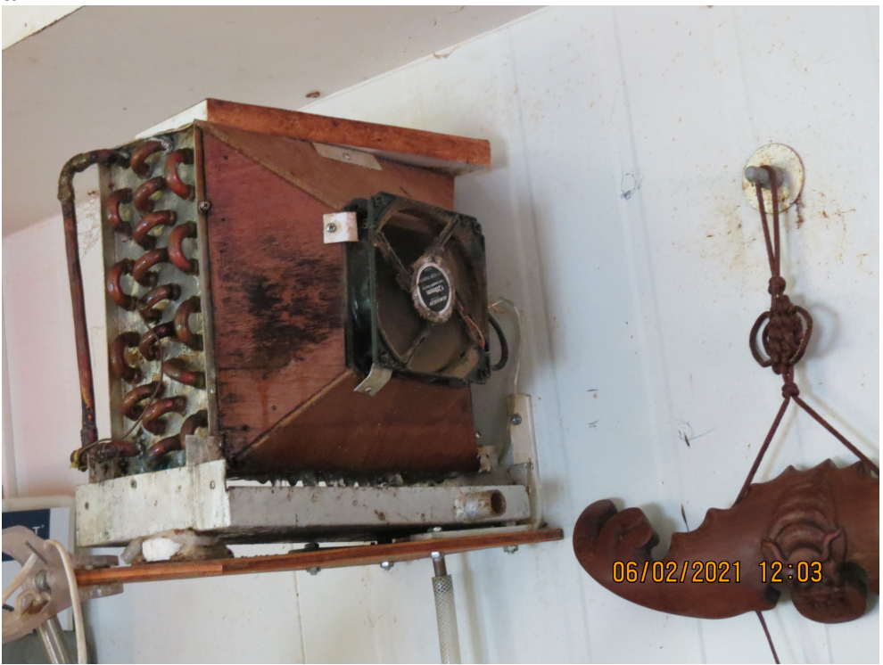
This is the evaporator – which condenses the water out of the air – and cools the lab – much appreciated in summer! Also it means that the microscopes etc. don't rot!

This is the condensing unit and compressor – which dumps the heat from the lab to the air.